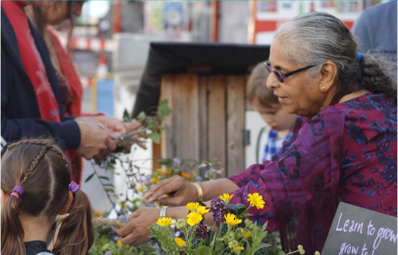
A volunteer at an Apple Day event, East London

We've gathered together further resources to help you in your efforts to promote wellbeing through volunteering. Look at our volunteering page for more information.