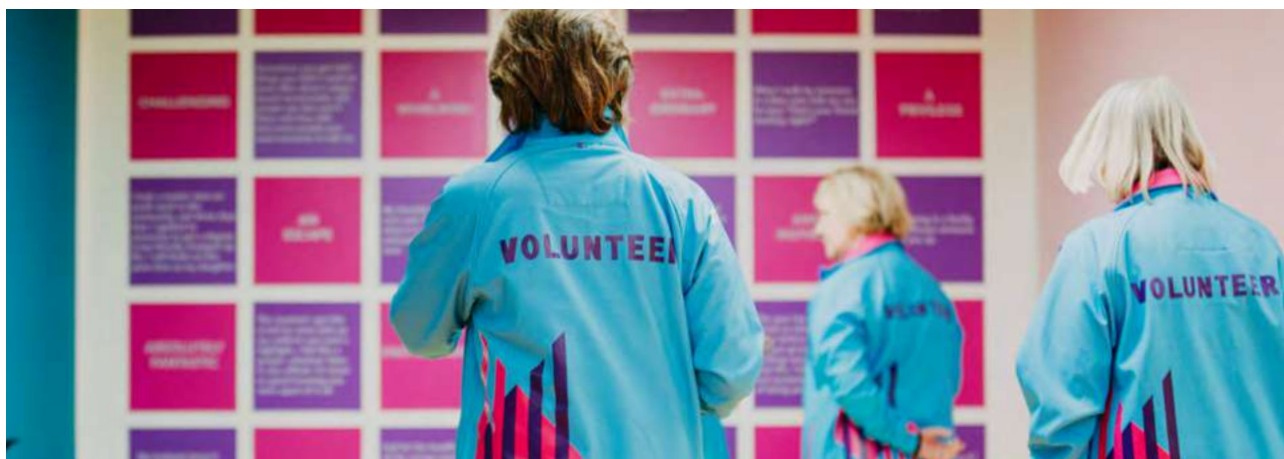
Volunteers at the launch of an exhibition at Humber Street Gallery