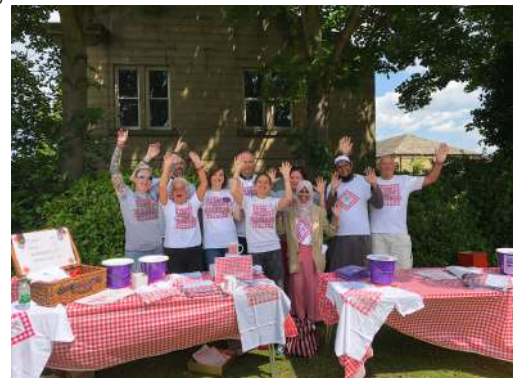
Volunteers at the More in Common initiative, Batley

*SOURCED FROM UK AND ABROAD, 2008 ONWARDS