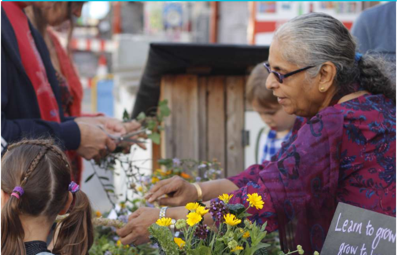
A volunteer at an Apple Day event, East London

We've gathered together further resources to help you in your efforts to promote wellbeing through volunteering. Look at our volunteering page for more information.