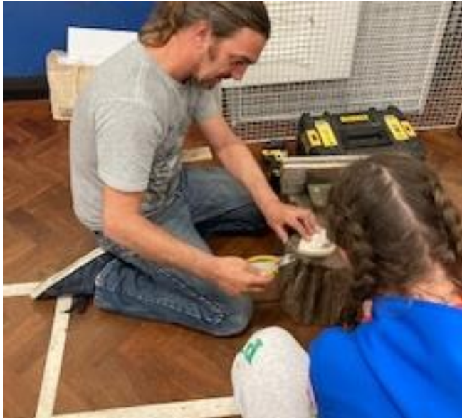
Slide 19: Art workshops with 10 th Monkseaton Guides, 19 th May, 9 th June & 23 rd June. 19