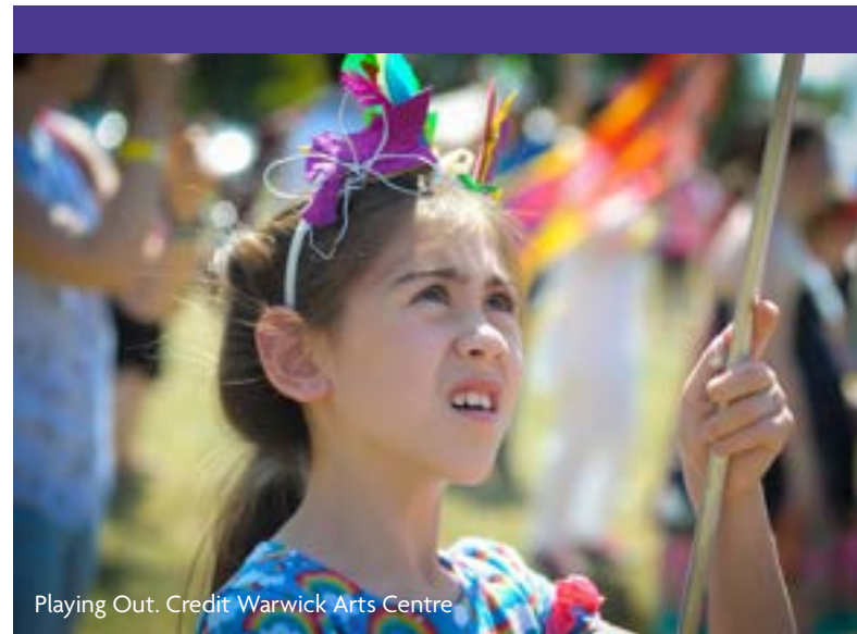
Playing Out.