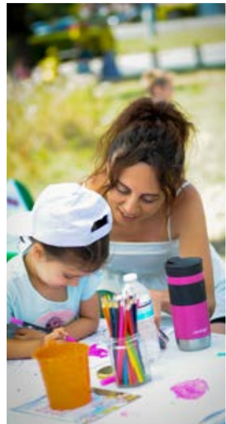
Playing Out.

Funding/partnership arrangements; Setup differences including co-design/co-production; Culmination events or ongoing; Groups deliberately working alongside each other across difference; Volunteers at events v other types of volunteering; legacy/longevity; individual Impacts e.g. greater confidence, skills development; process outcomes.