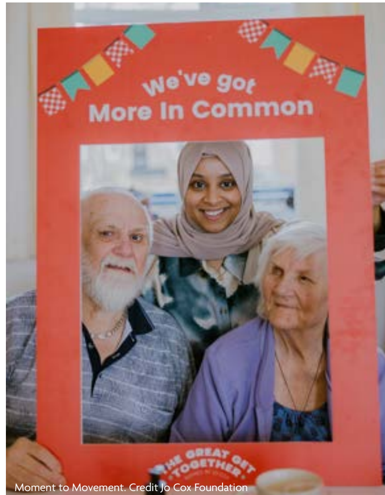
Moment to Movement.

The archive highlighted several examples of the detrimental impacts from having to move to online engagement and delivery. Throughout this analysis, we have mainly studied events and projects that took place in physical locations, and the impacts that in-person connection, participation, etc. have had on individuals and communities. However, events and community participation can also occur online. The Covid-19 pandemic and the ensuing mass shift from in-person to online for everything, including many of the events in the archive, presented new challenges and opportunities. There have remained stages of the event planning and delivery cycle that can be done virtually, bringing more equity in involvement for some groups, including disabled people and those living in more remote locations. However, as the examples that follow demonstrate, there are massive gains to social cohesion by in person events where, not only the planning and delivery of events can purposefully build in social cohesion opportunities, but also where the unexpected and spontaneous can happen.