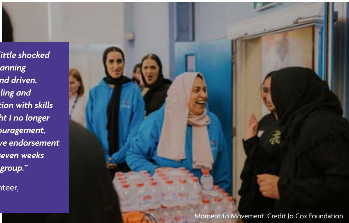
Moment to Movement.

Great Get Together volunteer, Jo Cox Foundation