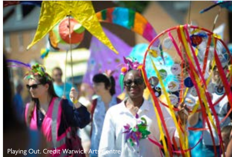
Playing Out.

address localised community needs, forming partnerships for longer-term impact and sustainability. And the Playing Out in Canley initiative transitioned from individual organisations with a desire to collaborate, to a cohesive group with strong partnership bonds, high levels of trust, and a clear commitment to continue working together.