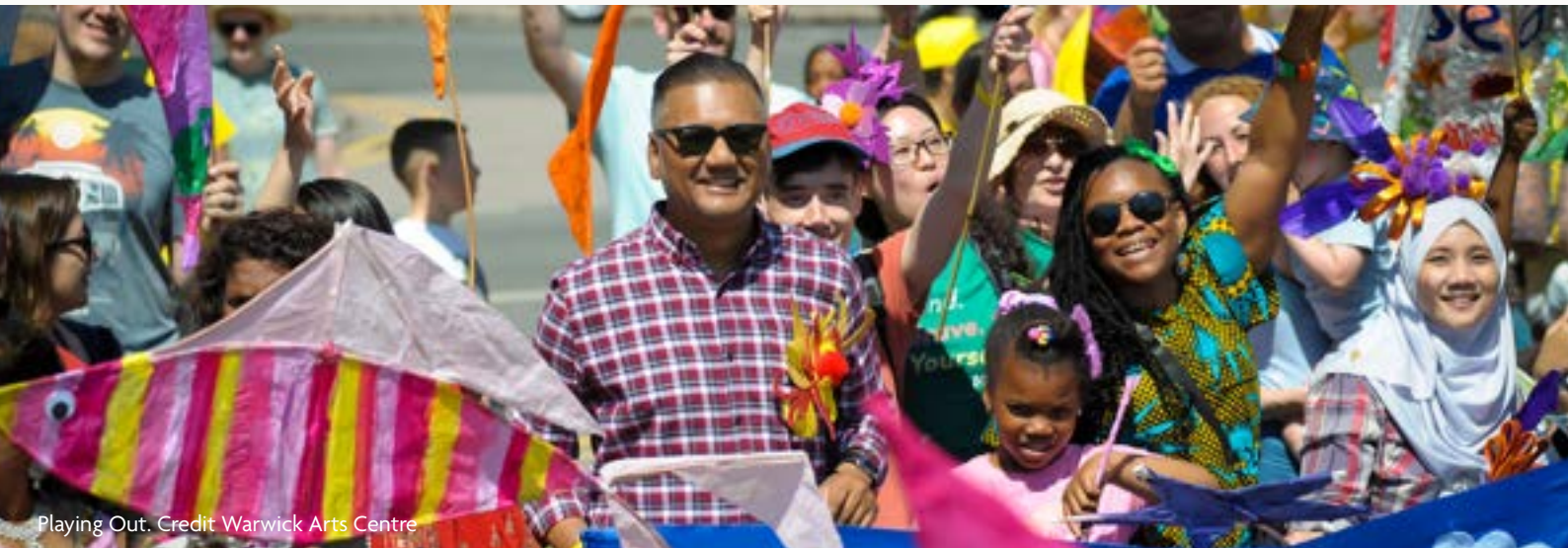
Playing Out.