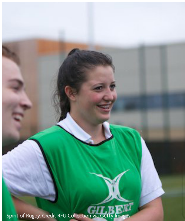
Spirit of Rugby.

The gains to social capital have been documented in the findings and these are closely related to the legacy that the projects have created. Almost all the reports mentioned the value of new friendships and deepening bonds. The importance of safe spaces for participants to explore new ways of understanding people who they had not had much contact with previously was evident through many of the reports. Events could