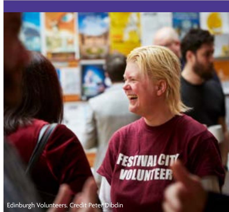
Edinburgh Volunteers.

Belong (2021) found that volunteering rates were higher during the pandemic in areas that had invested in social cohesion. The networking and links between local activists and local government structures had already been established and developed prior to the lockdowns. The results showed that at a particular point during the lockdowns: people were twice as likely to volunteer compared to people living elsewhere; people enjoyed a higher sense of neighbourliness (9.9% higher); there was a higher level of trust in local government's response to Covid-19 (8.2% higher); and importantly, people maintained positive attitudes about migrants to