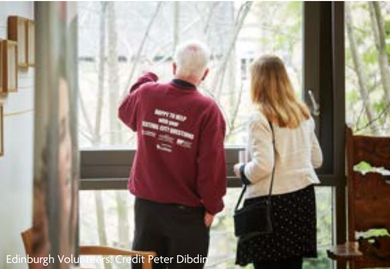
Edinburgh Volunteers.